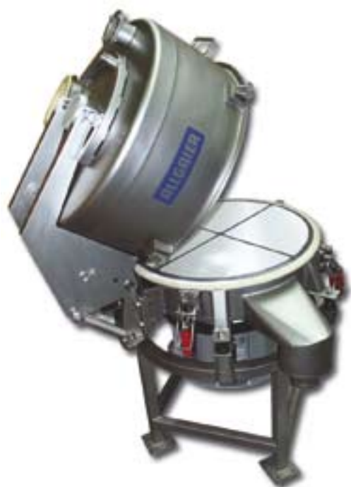
Vibration screening machine VTS 600 with hinged cover