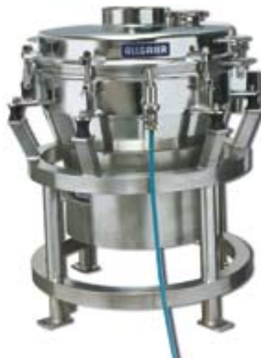
Vibration screening machine VTS 800 with ultrasonic mesh cleaning device