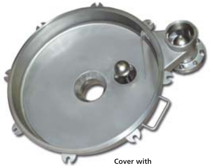
Cover with cleaning nozzles