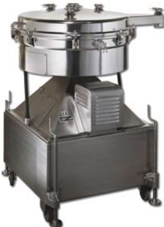
Tumbler screening machine TSM 1200 with movable support