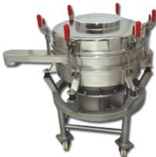
Vibration screening machine VTS 600 with movable support