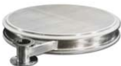
Ultrasonic screen insert