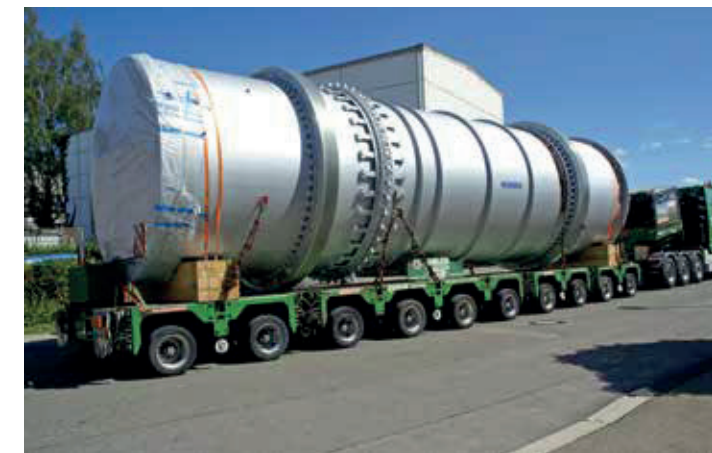
Drying-Cooling Drum for 100 t/h sand

It is possible to modify all MOZER double shell dryers delivered since 1985 to the system TK+ providing the existing installation conditions and the existing dust extraction plant.